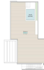
Vivienda Resident 4B

Usable Area ..... 69,14m 2 Superfície útil ..... 83,70m 2 Terrace area..... Superfície terraza Built Area /incl. Terrace/ ..... 169,54m 2 Superfície construída (incl. terrazas)