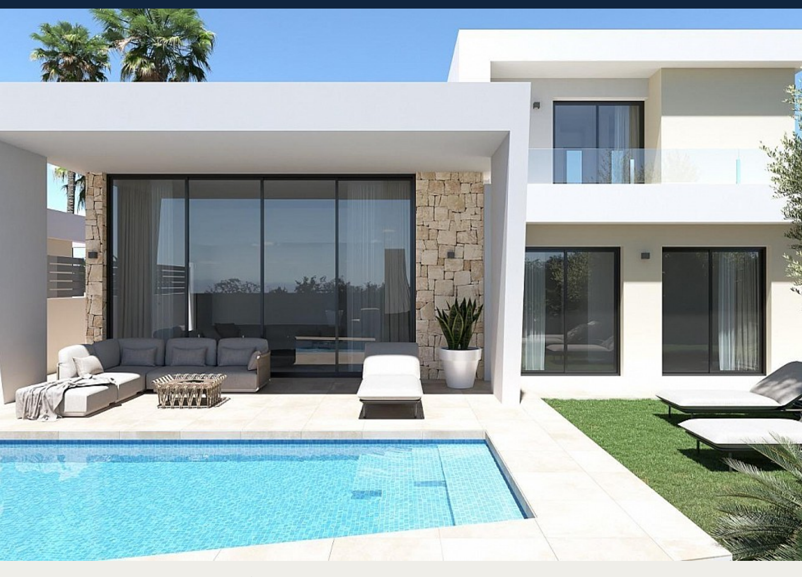
Fristående villa i Torrevieja - Nyproduktion