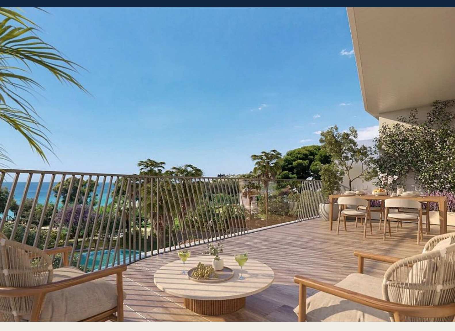
Lägenhet i Villajoyosa - Nyproduktion