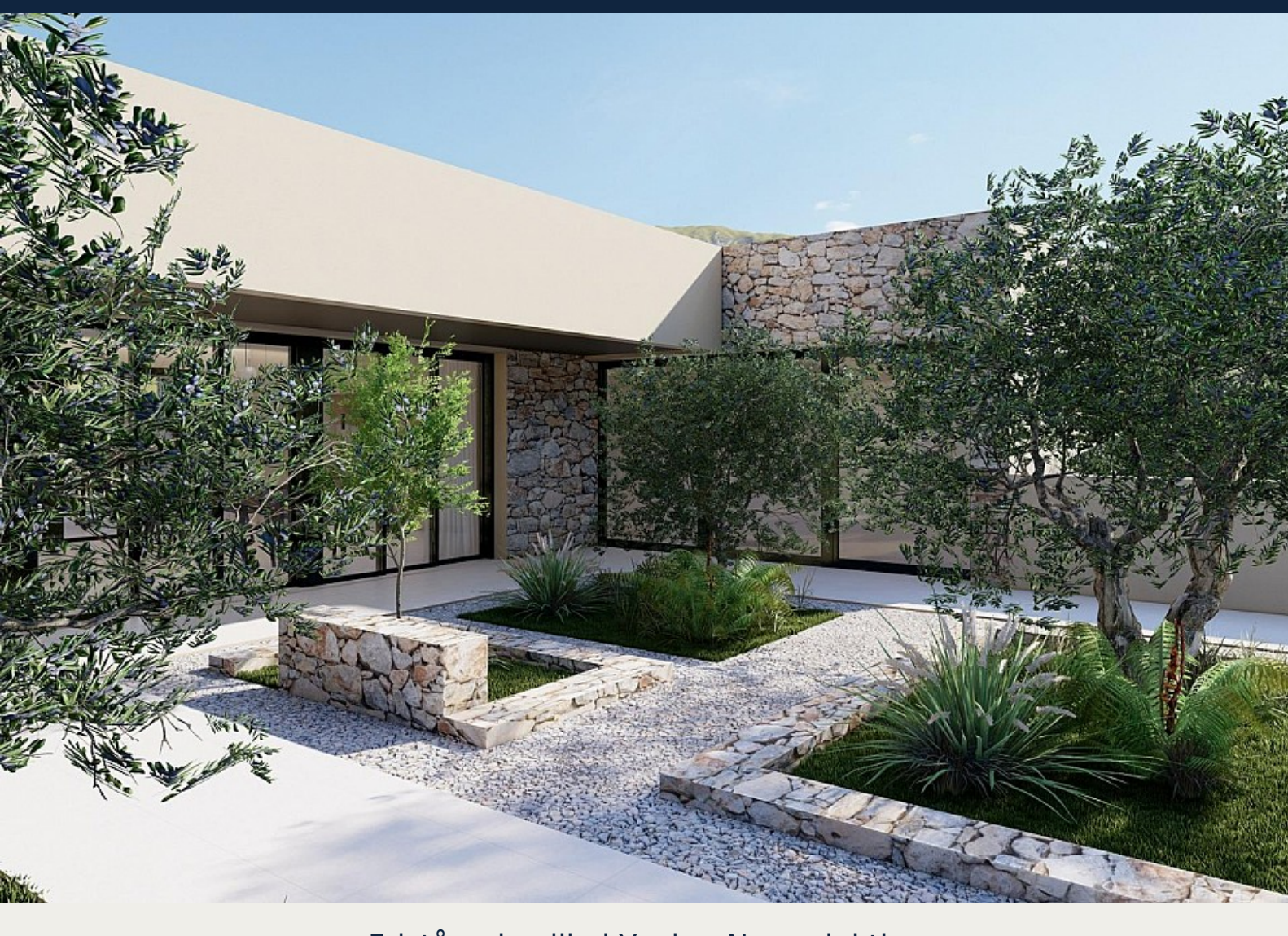
Fristående villa i Yecla - Nyproduktion