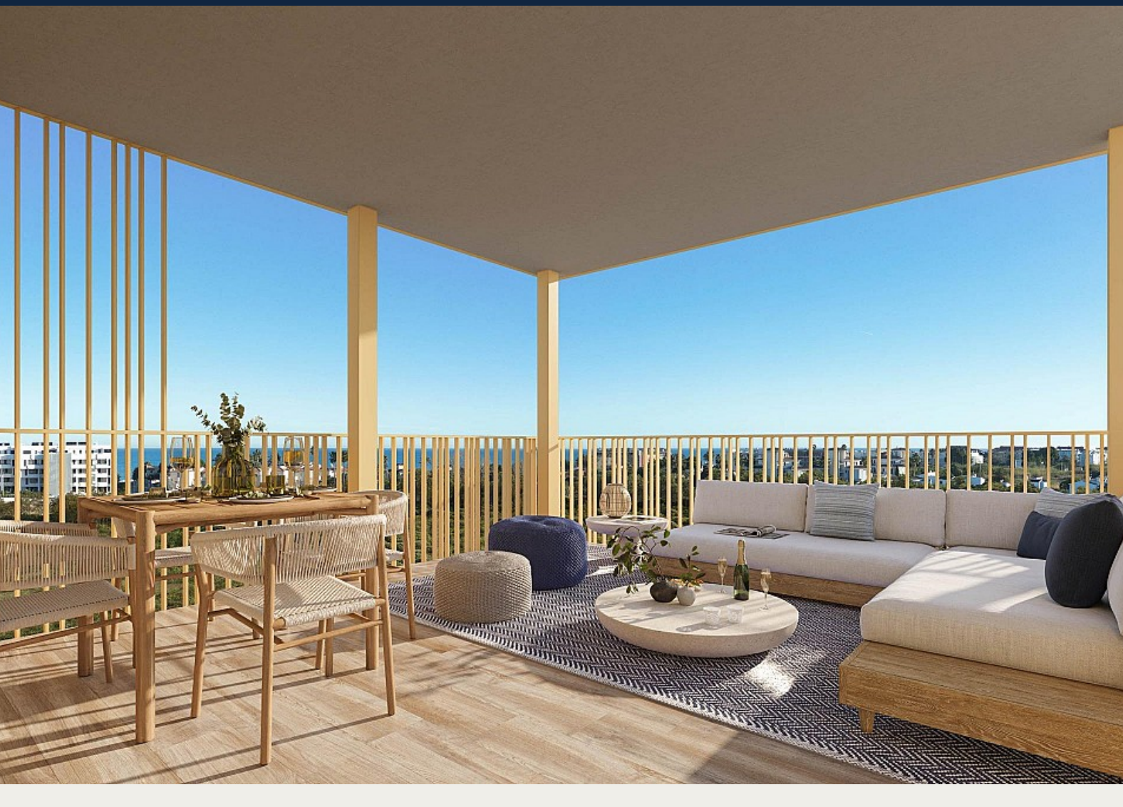
Lägenhet i El Verger - Nyproduktion