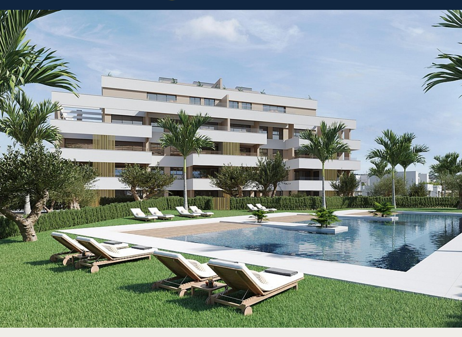
Lägenhet i Torre Pacheco - Nyproduktion