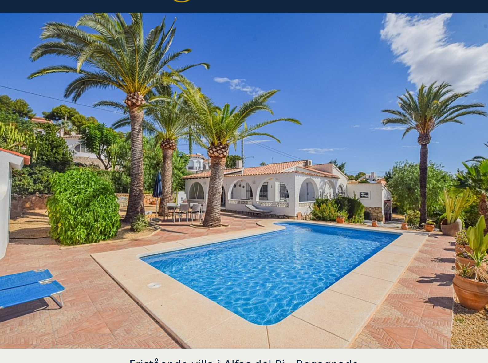
Fristående villa i Alfas del Pi - Begagnade