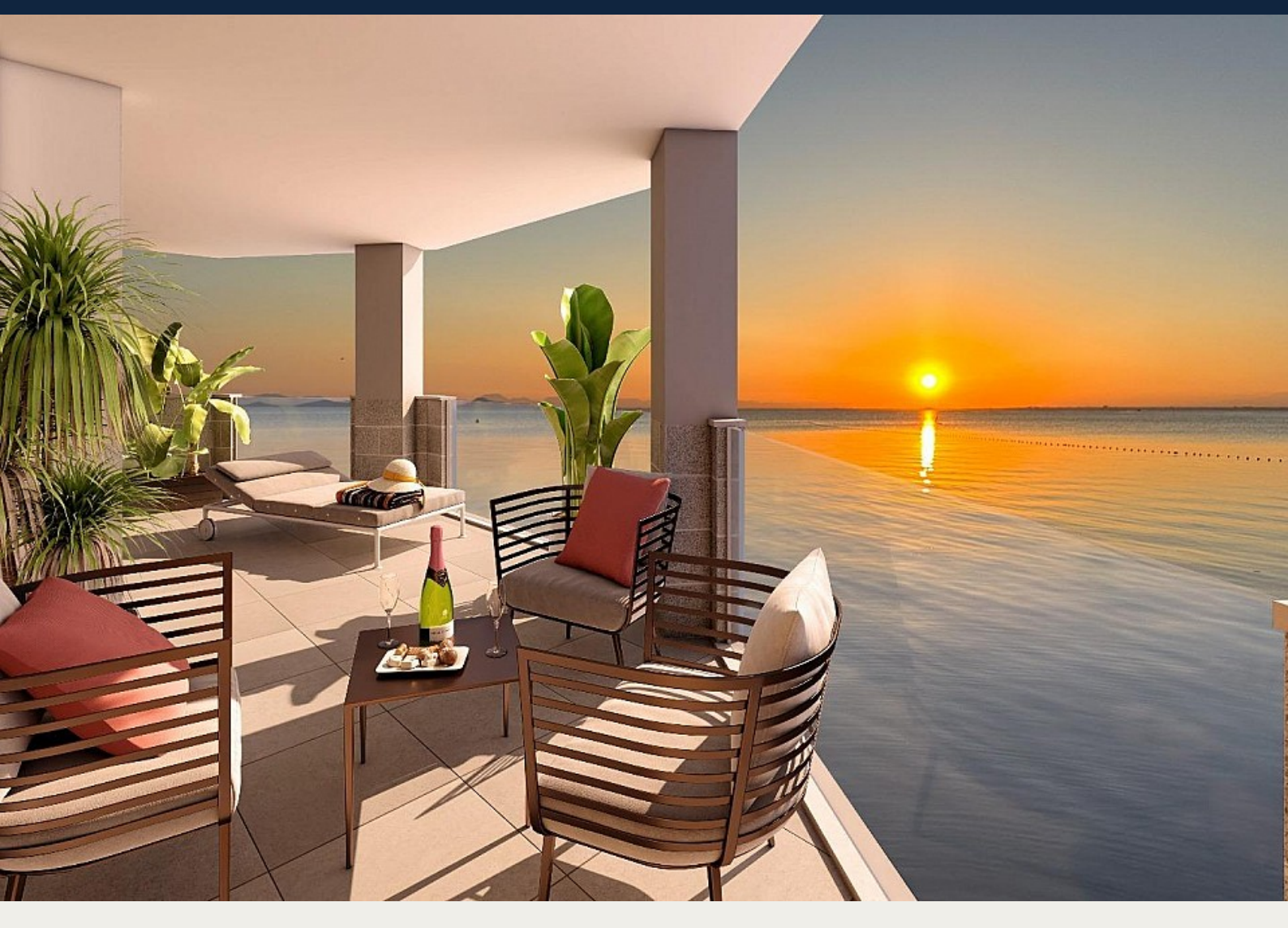
Lägenhet i La Manga del Mar Menor - Nyproduktion