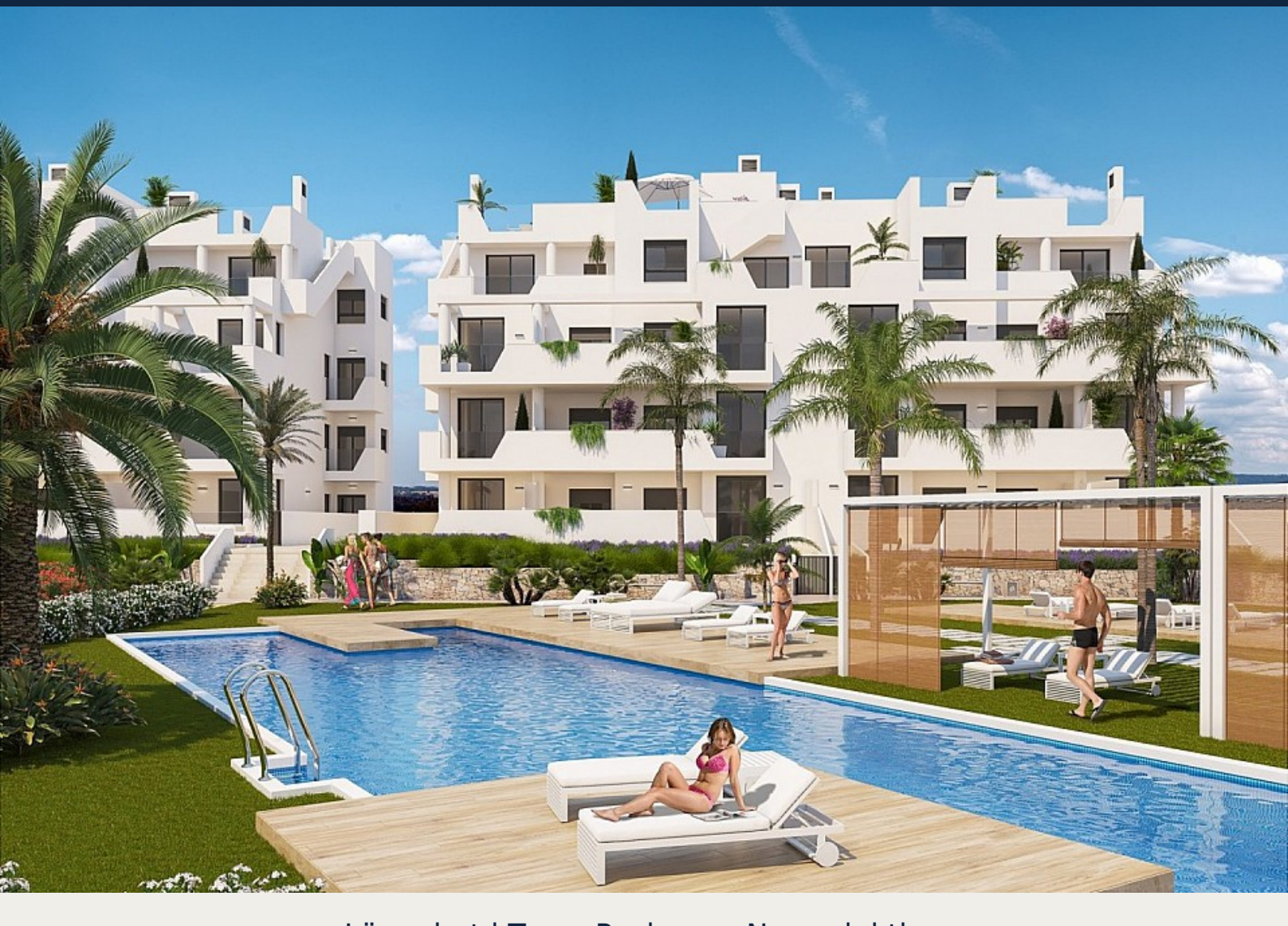
Lägenhet i Torre Pacheco - Nyproduktion