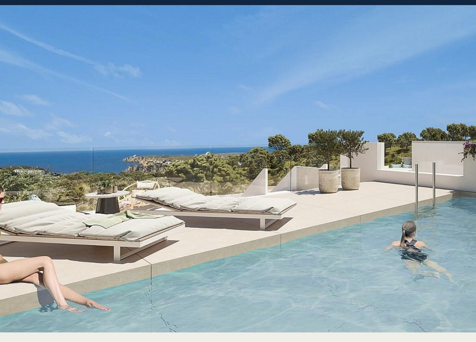
Takvåning i 3409 - Nyproduktion