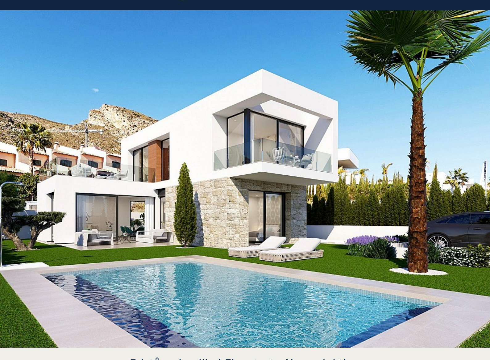
Fristående villa i Finestrat - Nyproduktion