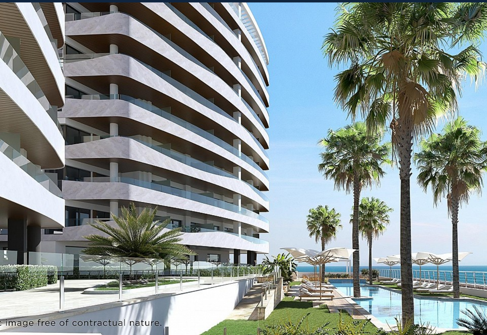
Image free of contractual nature.