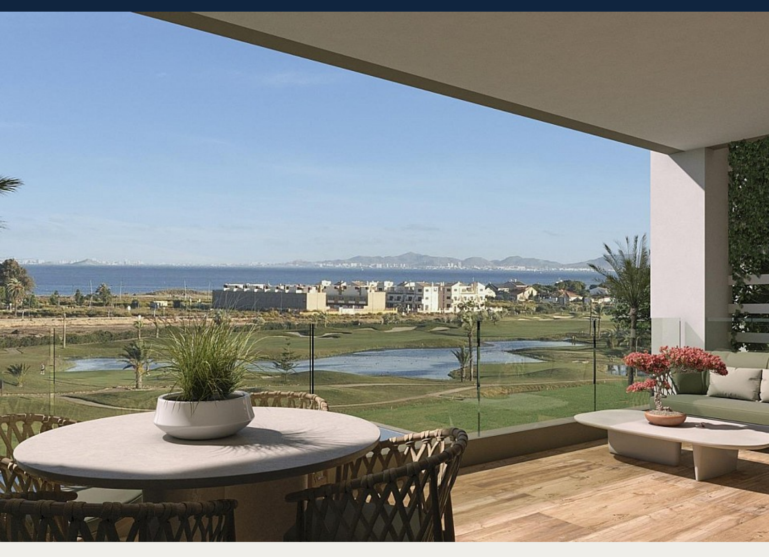
Takvåning i Los Alcázares - Nyproduktion