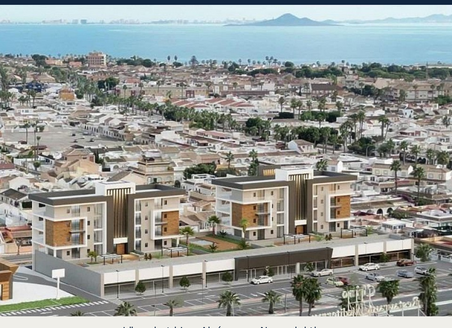
Lägenhet i Los Alcázares - Nyproduktion