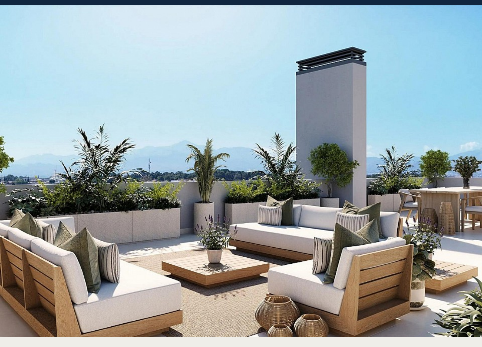
Takvåning i Alicante - Nyproduktion