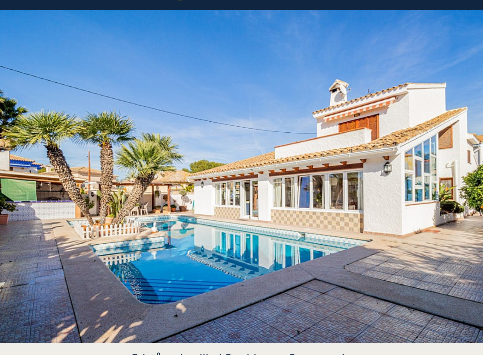
Fristående villa i Benidorm - Begagnade