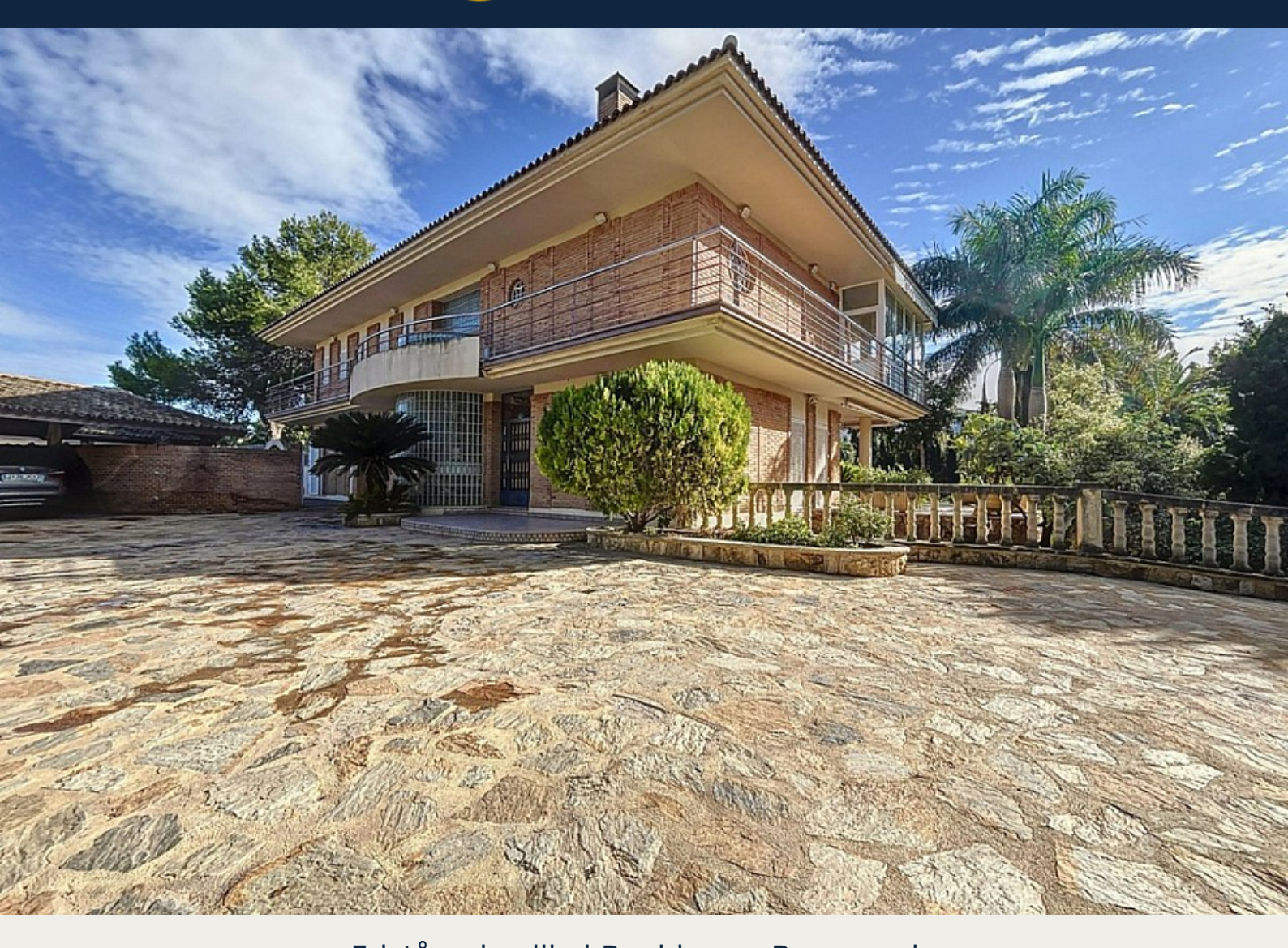
Fristående villa i Benidorm - Begagnade