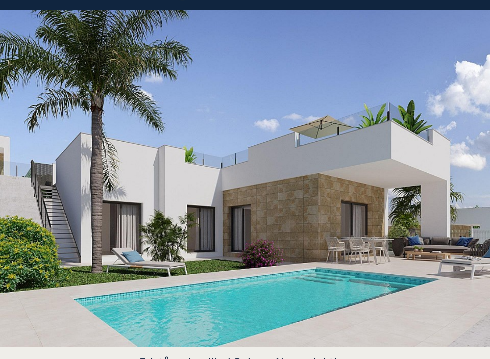
Fristående villa i Polop - Nyproduktion