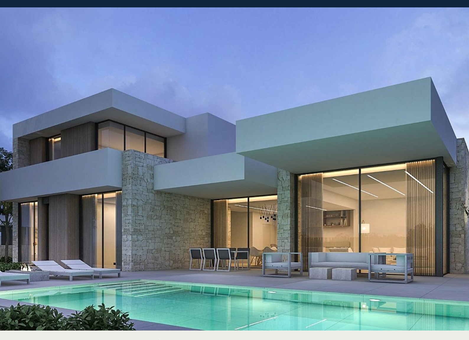
Fristående villa i Denia - Nyproduktion