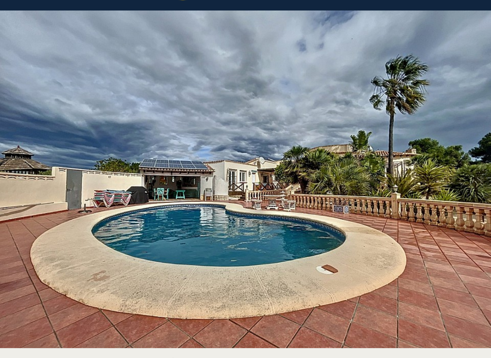
Fristående villa i Javea - Begagnade